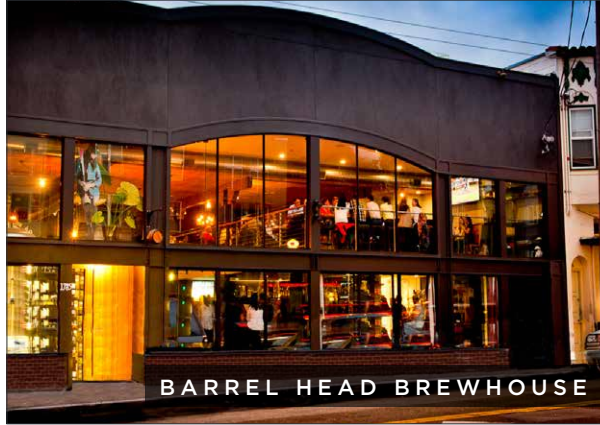
BARREL HEAD BREWHOUSE