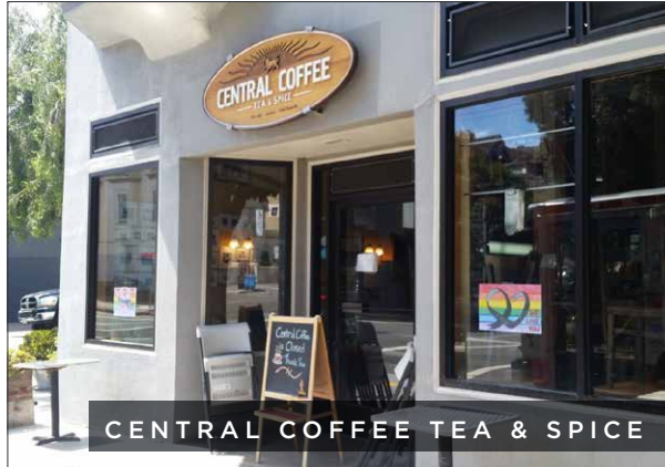
CENTRAL COFFEE TEA & SPICE