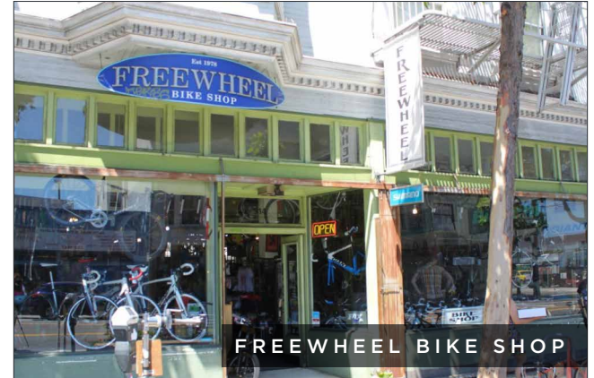
FREEWHEEL BIKE SHOP