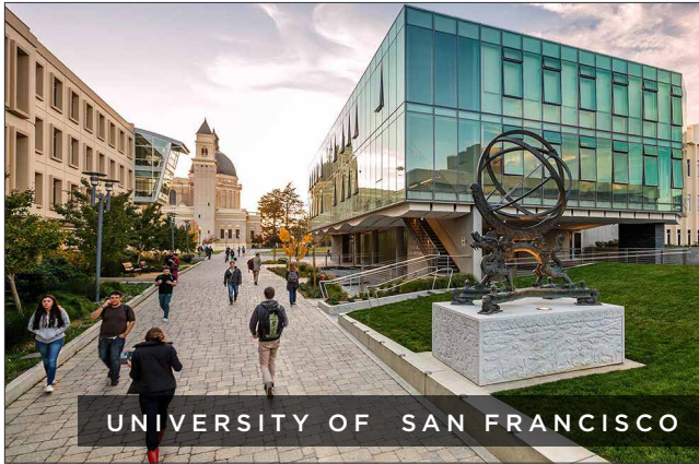
UNIVERSITY OF SAN FRANCISCO