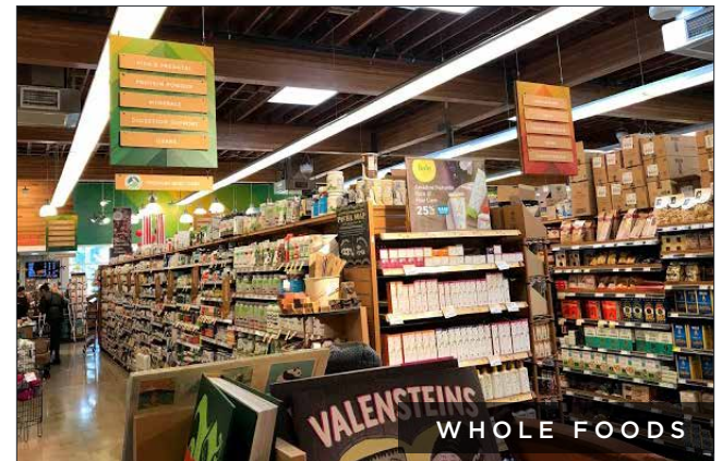
VALENSTEINS WHOLE FOODS