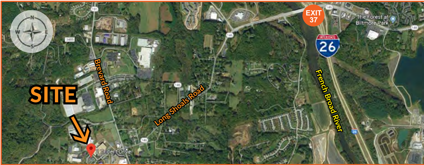
Aerial showing proximity to I-26