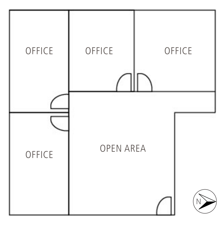
FLOOR PLAN | SUITE 360 | 1,257 SF