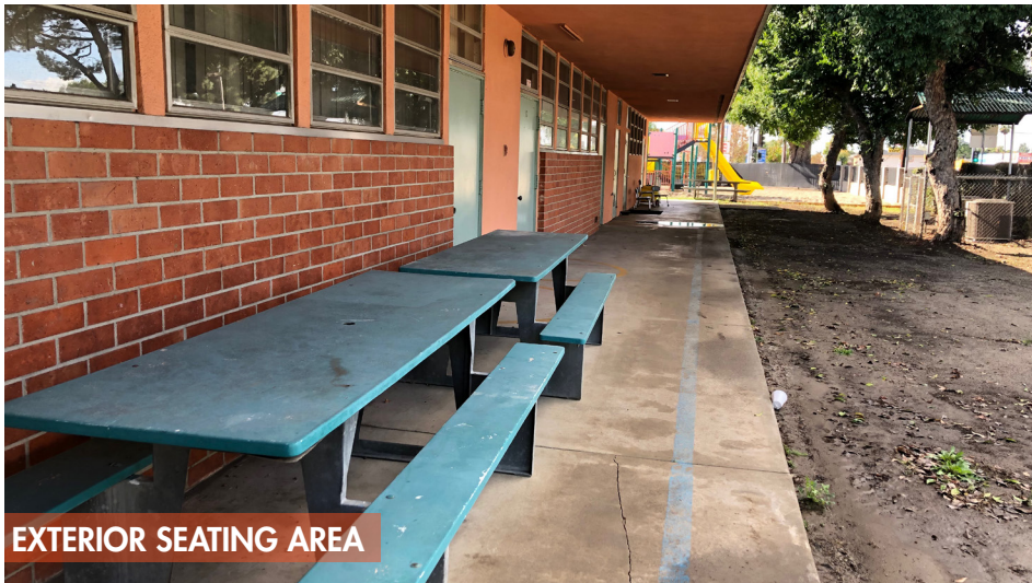
EXTERIOR SEATING AREA