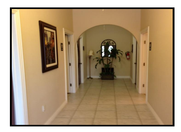
1660 Keller Pkwy.