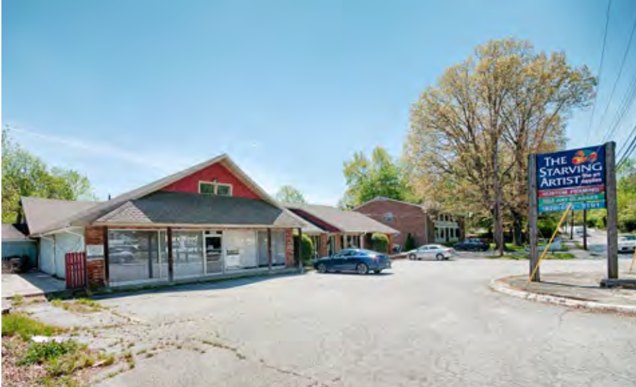
Easy ingress/egress, shared signage with adjacent business, The Starving Artist

814-A Kanuga Road, Hendersonville, NC 28739