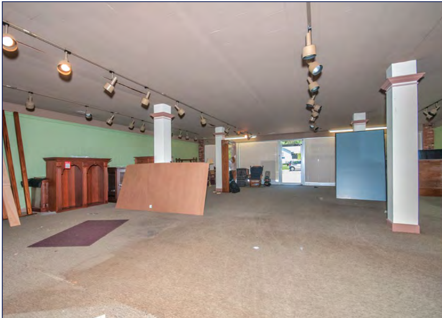
This former furniture showroom's openness allows for flexible planning for a new venture