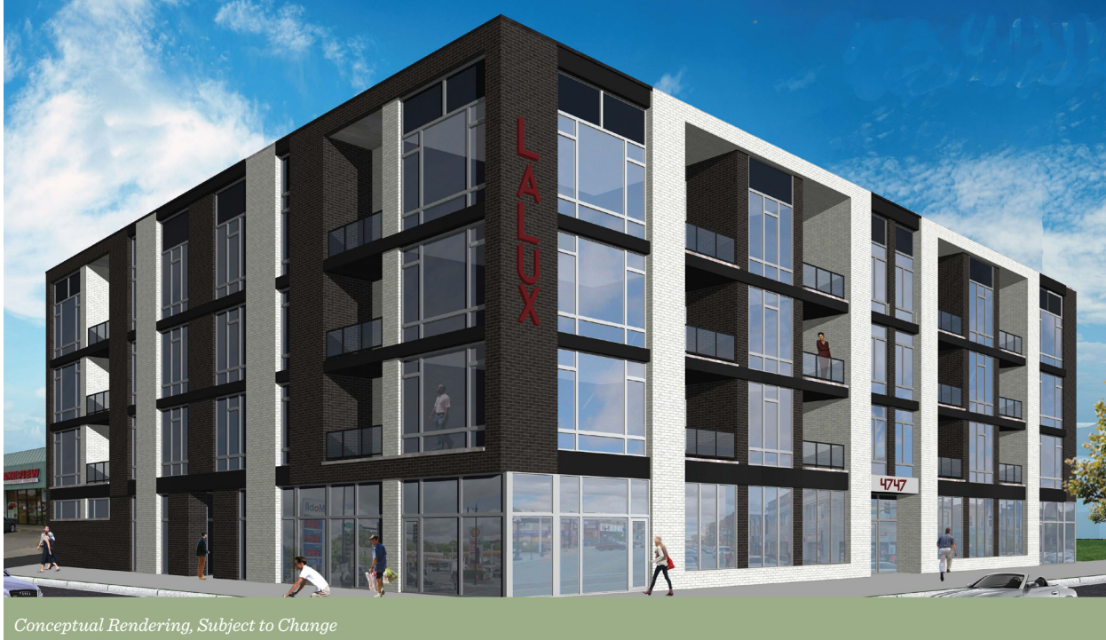
Conceptual Rendering, Subject to Change