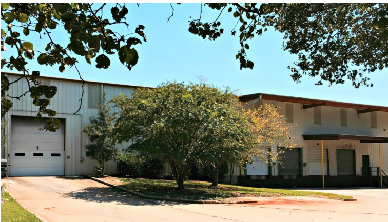
Drive-In & Dock Doors