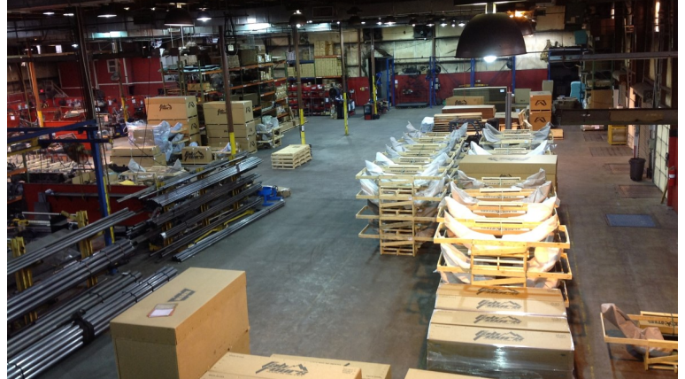
Dock Levelers in Warehouse