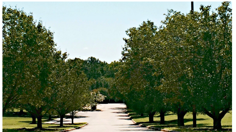
Tree Lined Concrete Drive

All information regarding property for sale, rental, financing is from sources deemed reliable but no warranty or representation is made as to the accuracy thereof and same is subject to change of price omissions, errors or other conditions prior to sale, lease, or withdrawal.