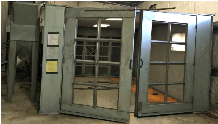
Powder Coating Equipment