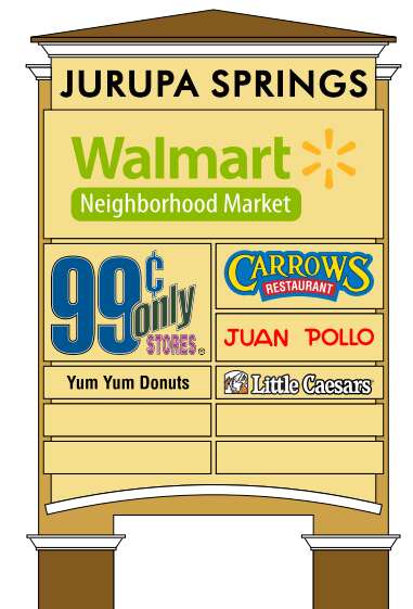
20' Foot Sign - Limonite Ave.