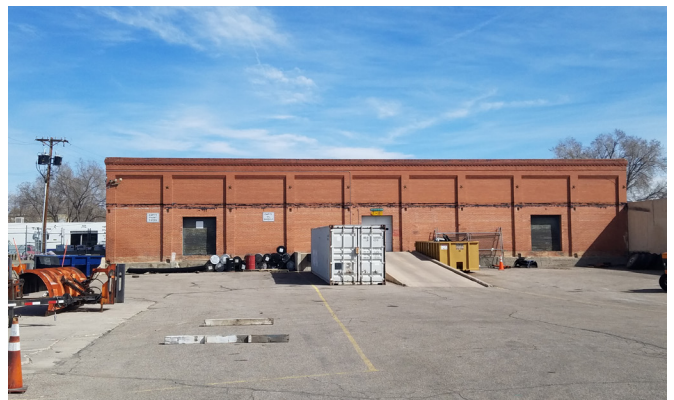
BRICK INDUSTRIAL BUILDING