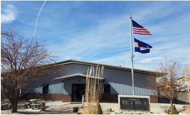
OFFICE BUILDING (A)