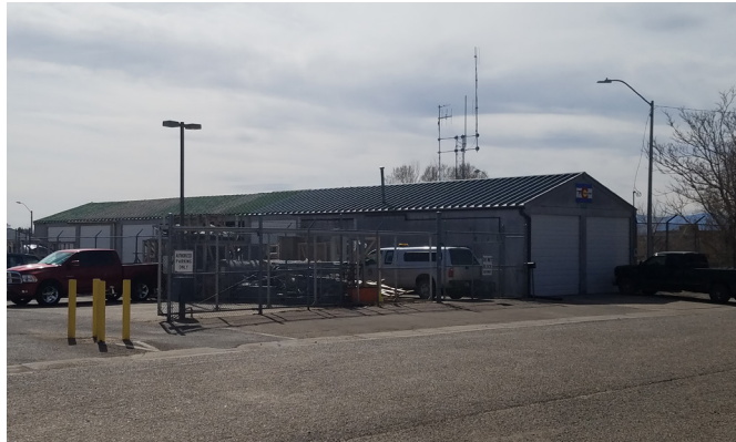
MEDIUM METAL INDUSTRIAL BUILDING