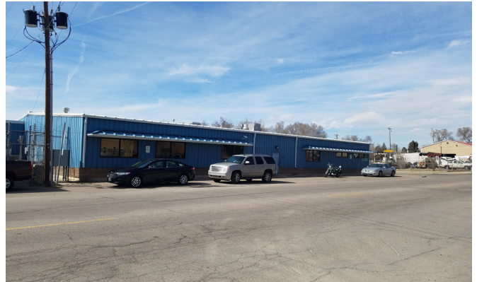
OFFICE BUILDING (B)