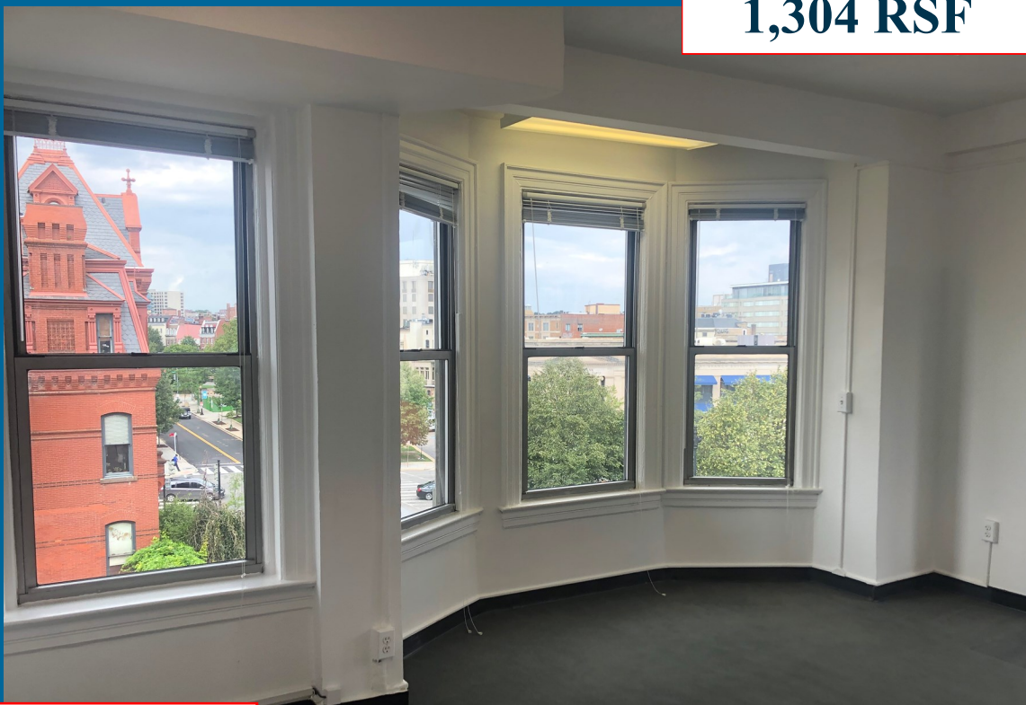
THE TORONTO BUILDING 2000 P STREET, N.W.