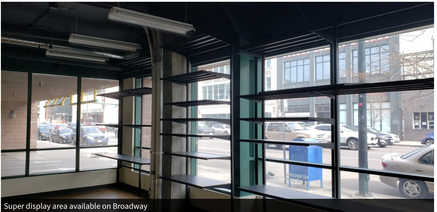
Super display area available on Broadway