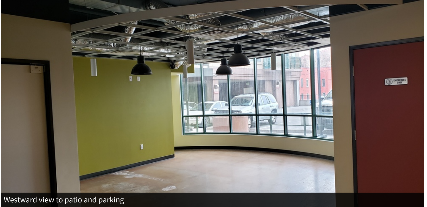
Westward view to patio and parking