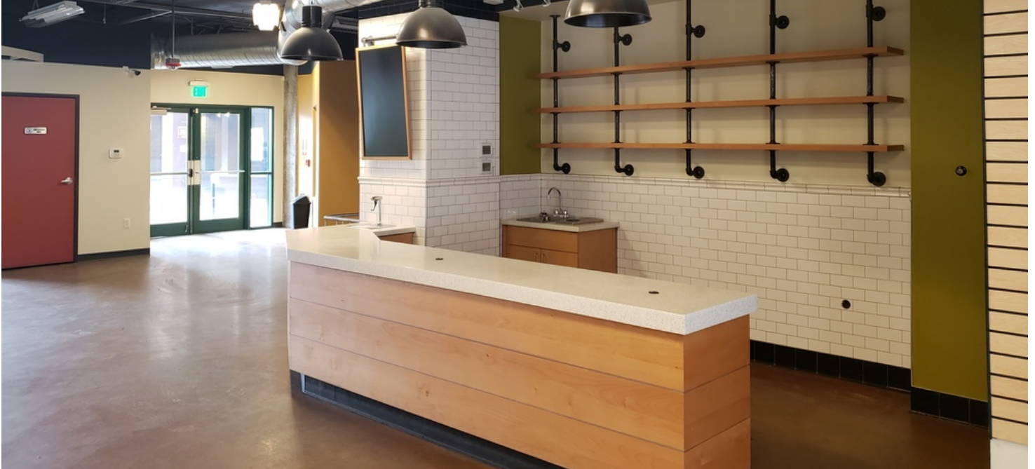
West entrance at rear