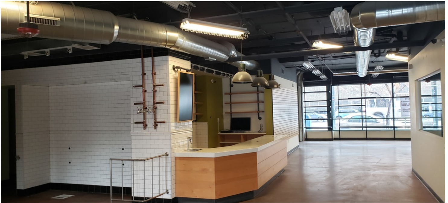
Fantastic glass storefront on Broadway