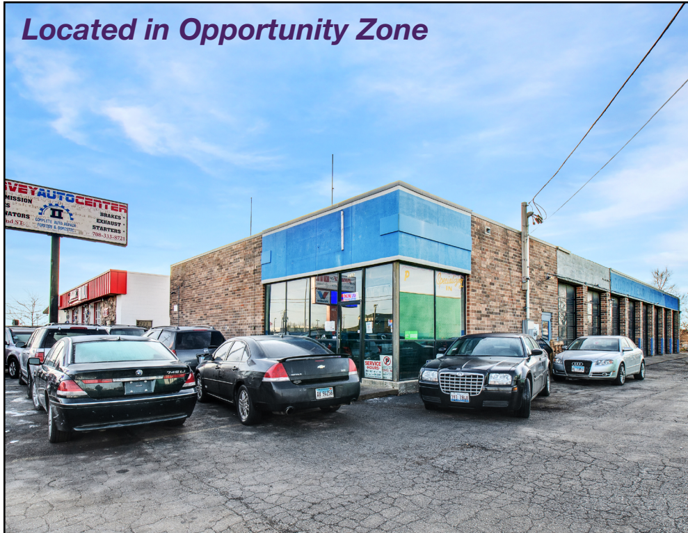
Located in Opportunity Zone