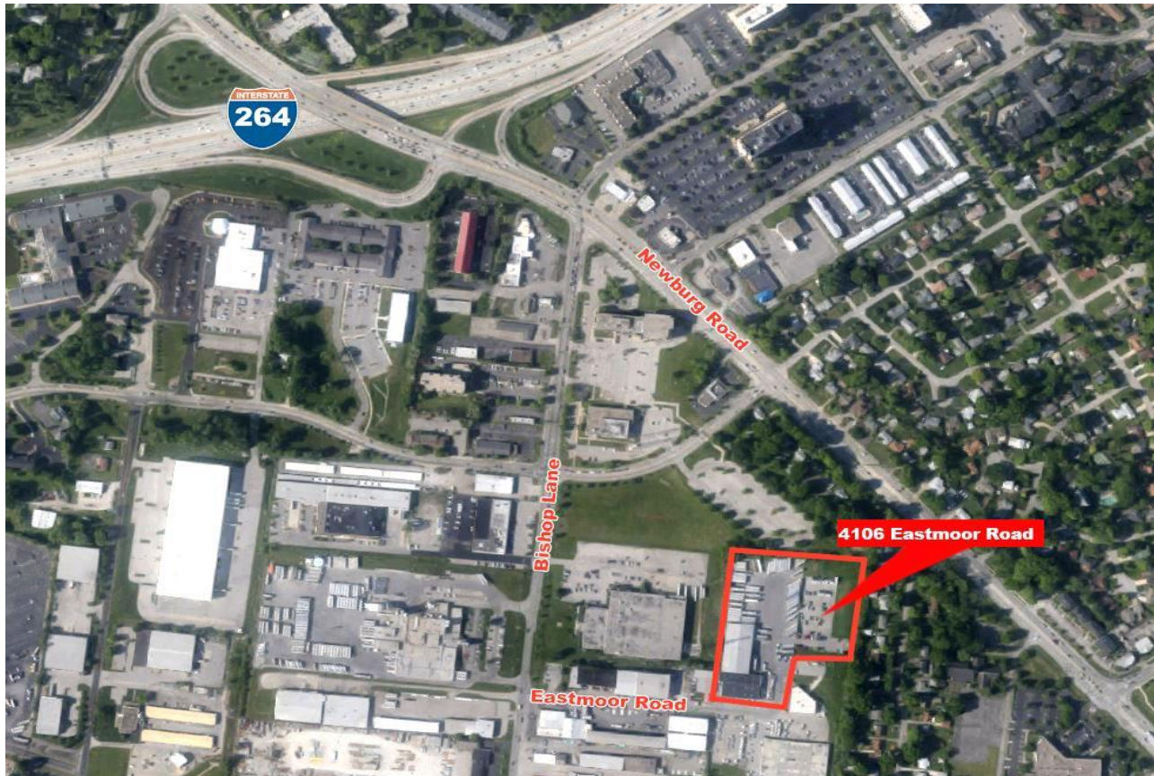
Convenient, central location with quick access to I-264, I-65, I-64 and I-71