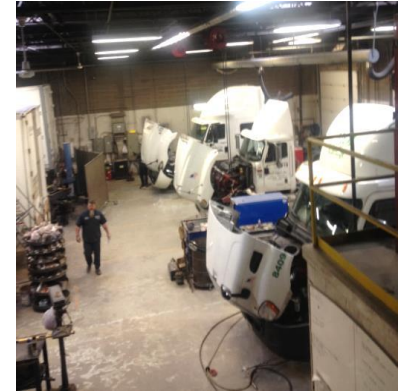
Truck Maintenance Shop