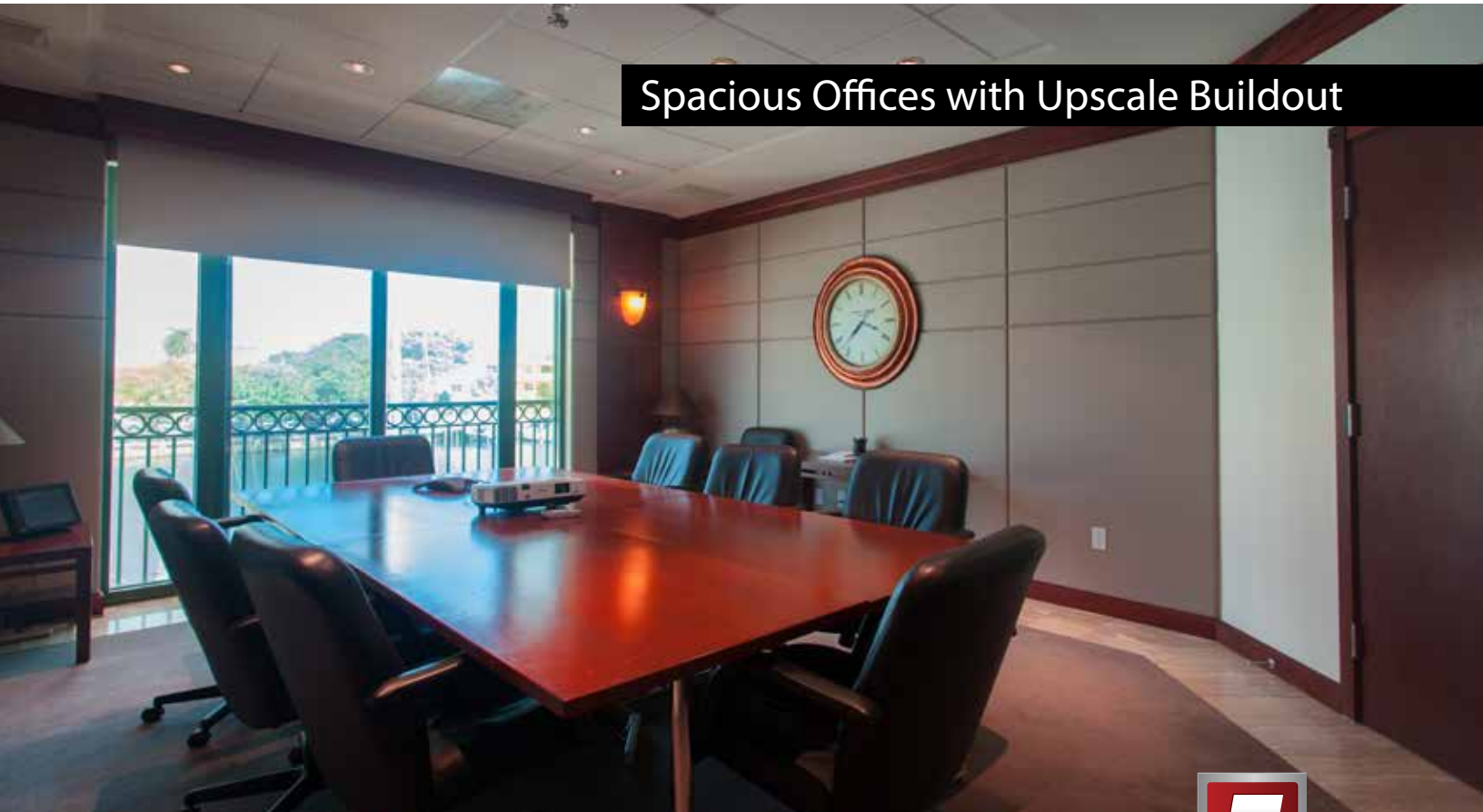
Spacious Offices with Upscale Buildout

FOR ADDITIONAL INFORMATION PLEASE CONTACT