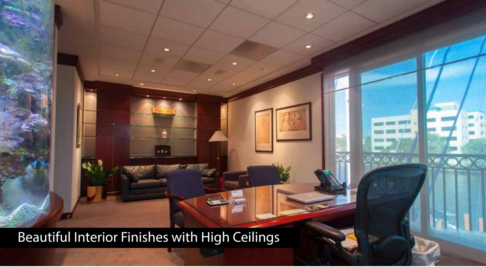
Beautiful Interior Finishes with High Ceilings