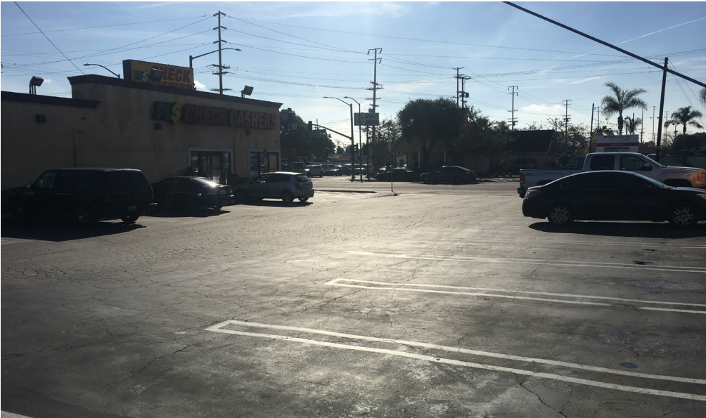
3210 E. FLORENCE STREET & 7121-7125 STATE STREET, HUNTINGTON PARK, CA 90055