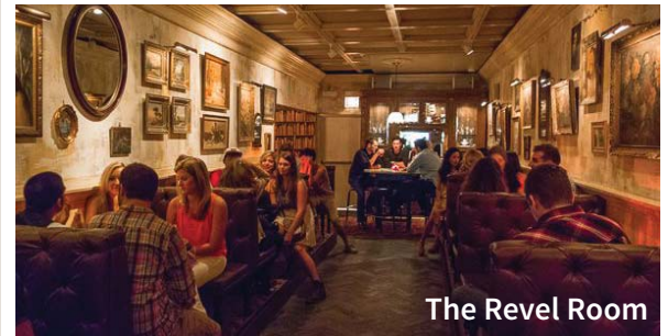
The Revel Room