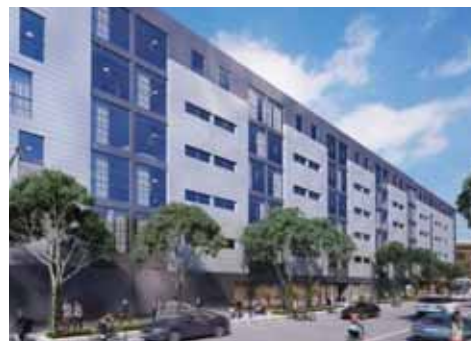
L – 120 Units