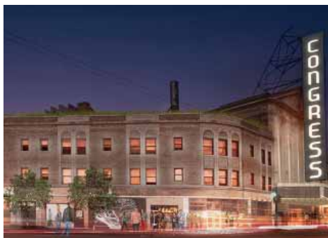
Congress Theater – $55M Renovation