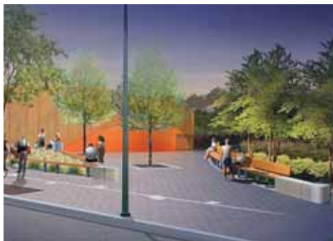
Urban Orchard Project – Proposed