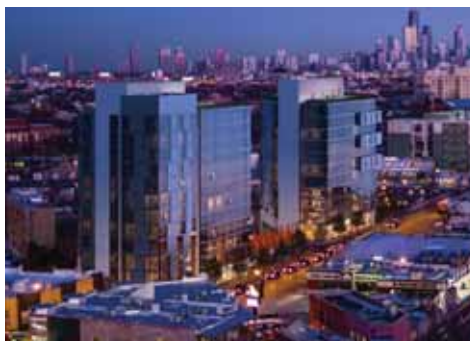
MiCa – 253 Units