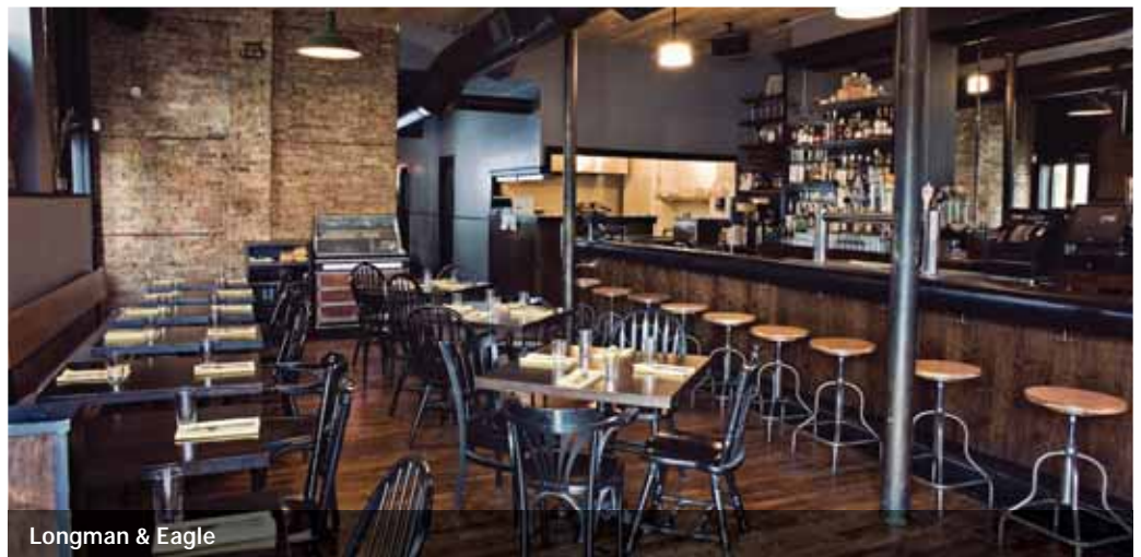
Longman & Eagle