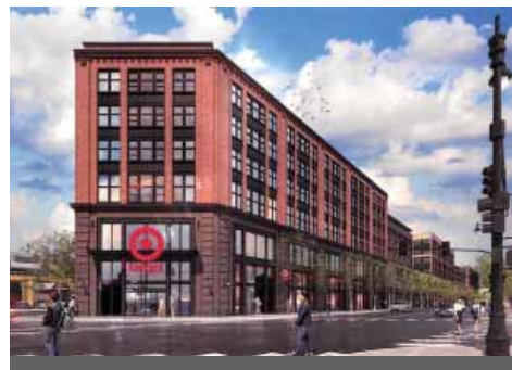
Logan's Crossing – 220 Units Under Construction