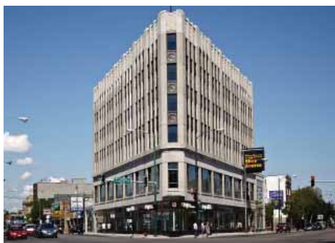
Hairpin Lofts – 40 Units Renovated