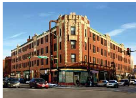
2799 N. Milwaukee – 99 Units Renovated