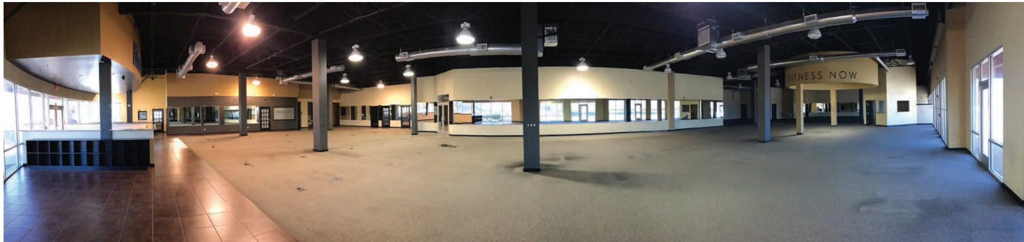
Interior of Fitness Center