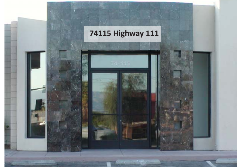
74115 Highway 111