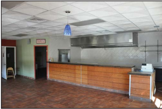
Kitchen and Dining