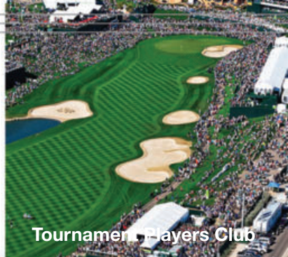
Tournament Players Club