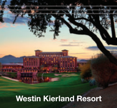
Westin Kierland Resort