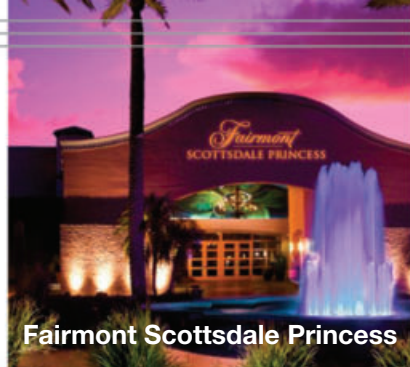
Fairmont Scottsdale Princess