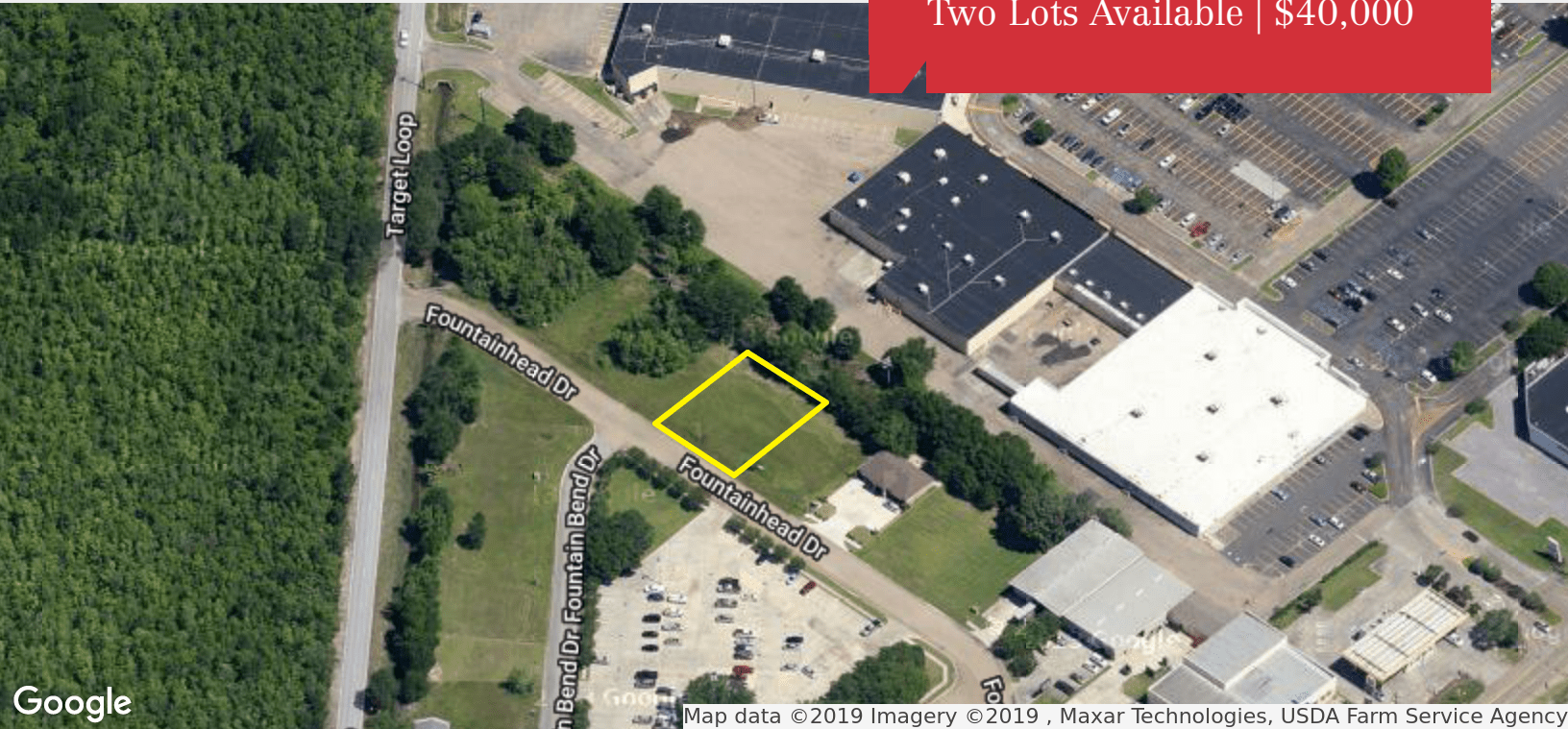
Map data ©2019 Imagery ©2019, Maxar Technologies, USDA Farm Service Agency