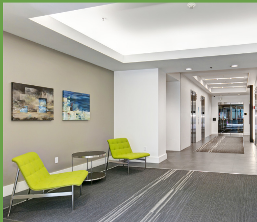
NEW 1000 DEXTER LOBBY