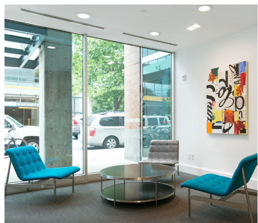
NEW 1100 DEXTER LOBBY