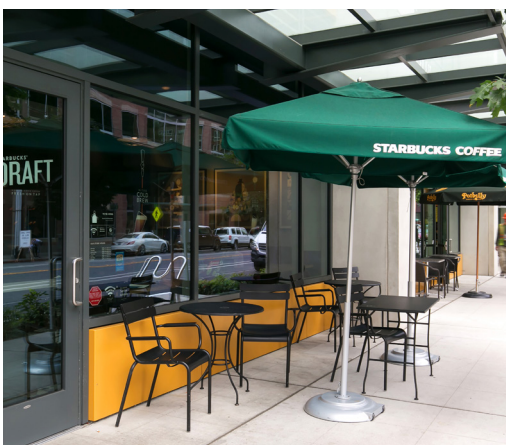
STARBUCKS ACROSS THE STREET