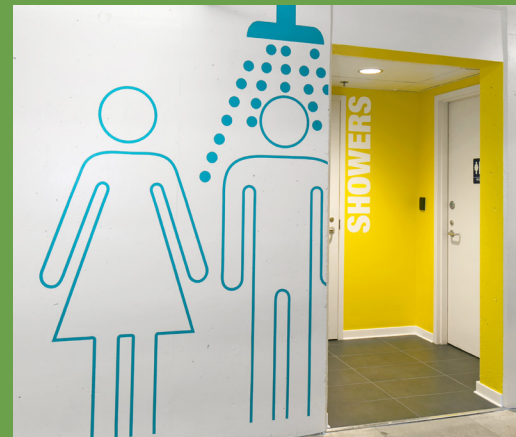
BUILDING SHOWERS & LOCKERS