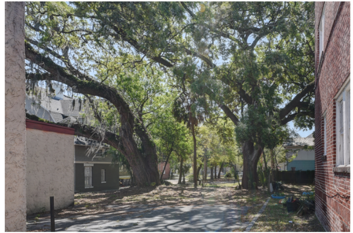
Oak tree covered patio space