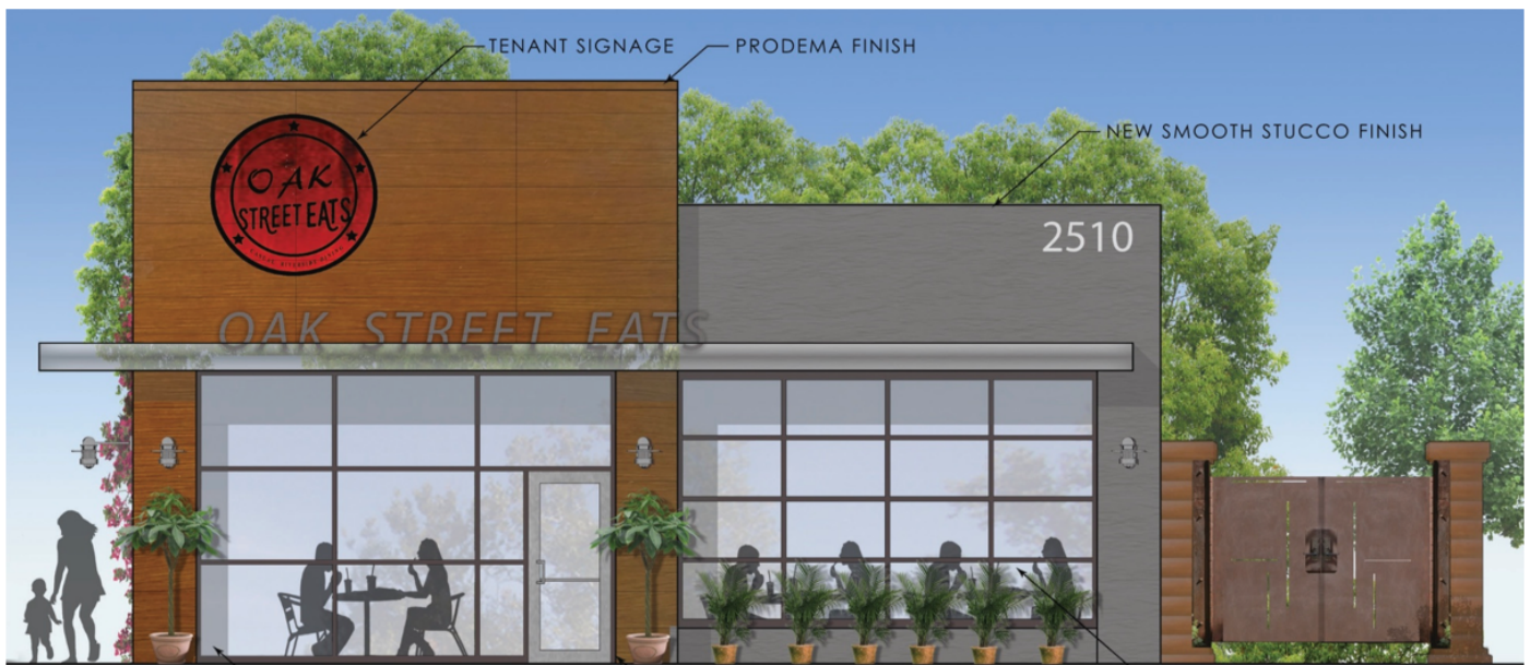
Front façade rendering