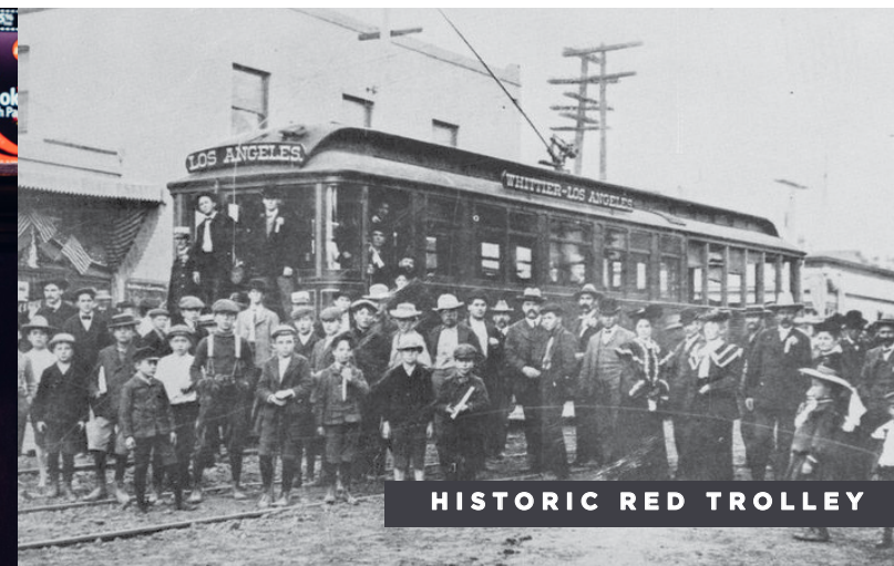
HISTORIC RED TROLLEY