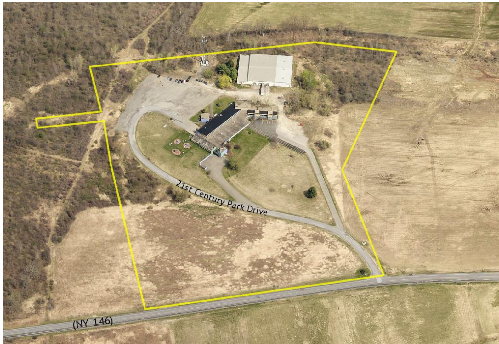
Approximate plot lines; subject to survey verification