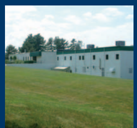
148,370 Square Feet Sub-Dividable

Brady Sullivan Properties is pleased to present "For Lease" 645 Harvey Rd. in Manchester, NH. This 148,370 +/-square foot facility is located in the foreign trade zone at the Manchester Airport. The facility sits on 10 acres and offers a mixed use of office / R & D / Light Assembly and warehouse space.