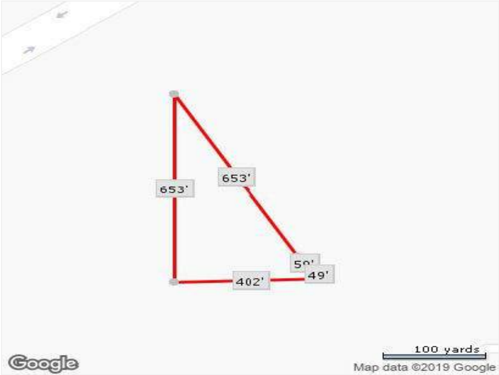
140-08-202-006, Sunrise Manor, NV, Clark County RealistReport