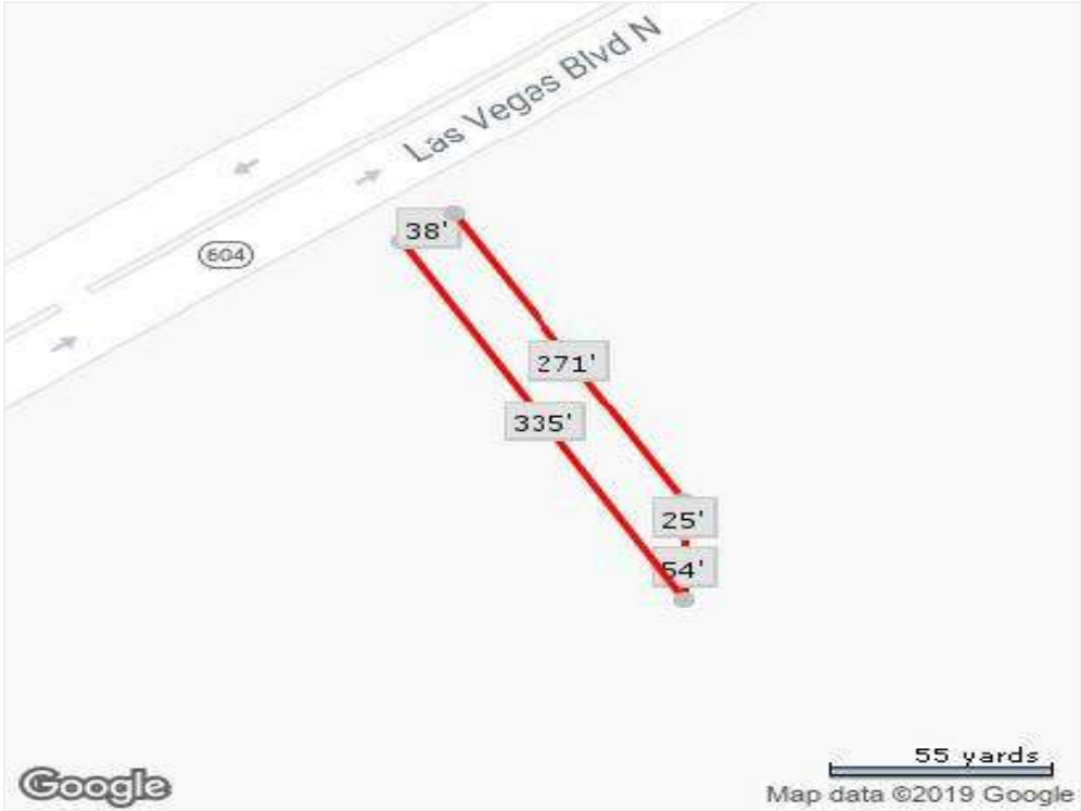
140-08-202-005, Sunrise Manor, NV, Clark County