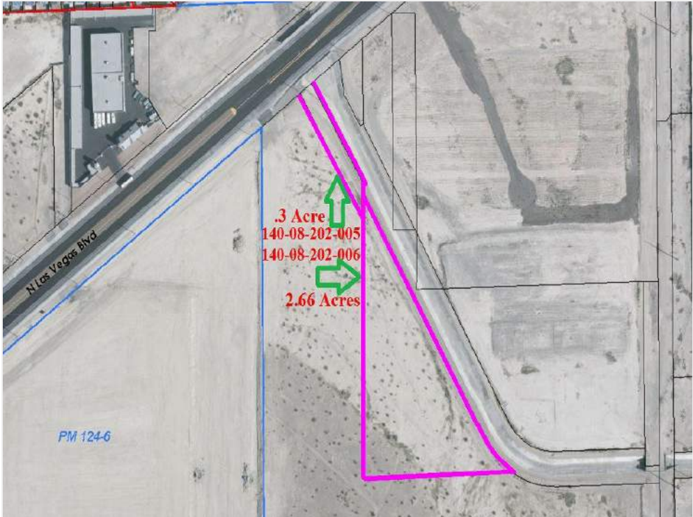
140-08-202-005 and 006 Gizmo Aerial