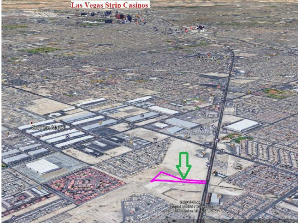
Google Earth Looking At Strip