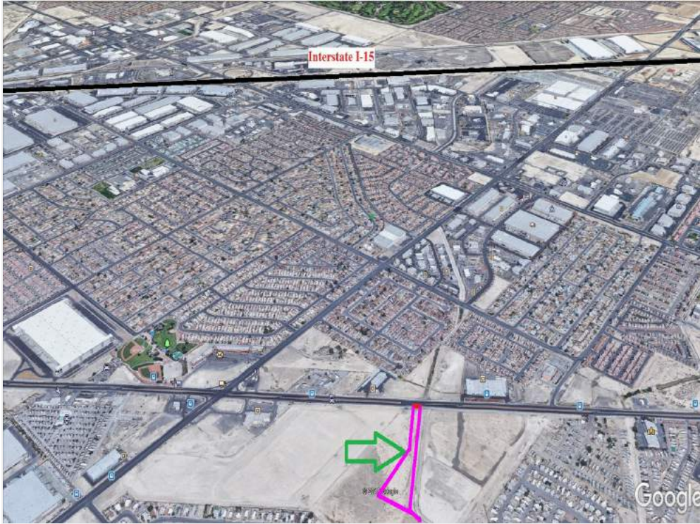
Google Earth Looking to I-15