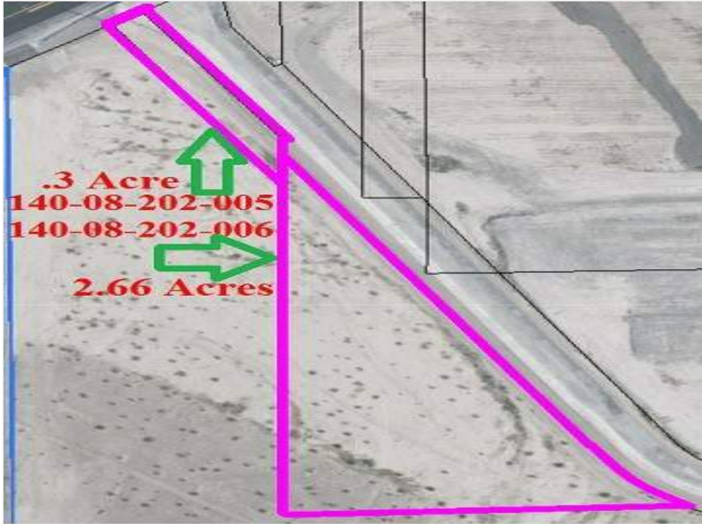
Close Up Gizmo Aerial