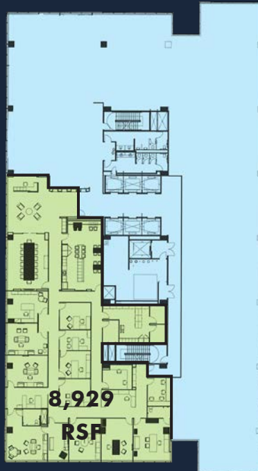
FLOOR 12 - 8,929 RSF