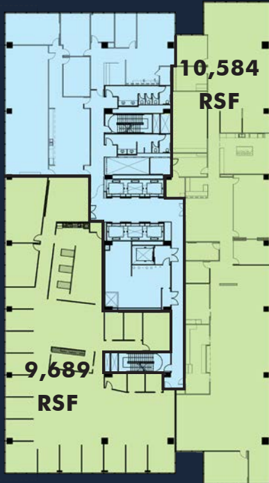
FLOOR 9 - 20,273 RSF