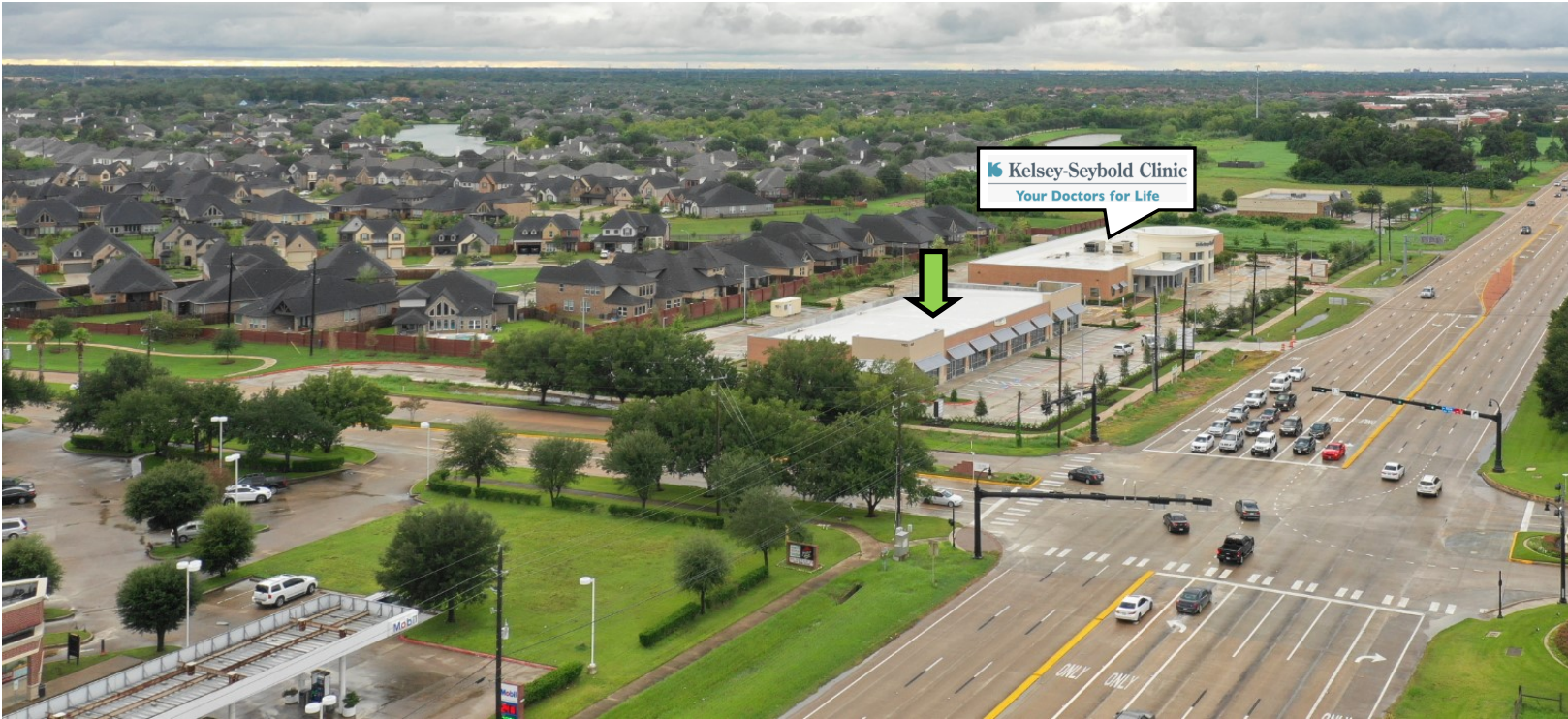
(Pitney Bowes data accessed from Komreal.com 2019)