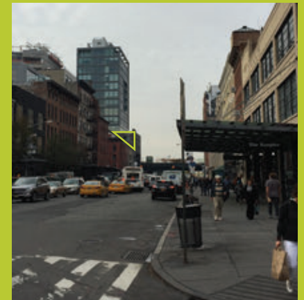
9TH AVE AND 14TH ST