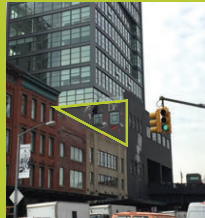
WASHINGTON ST AND 14TH ST