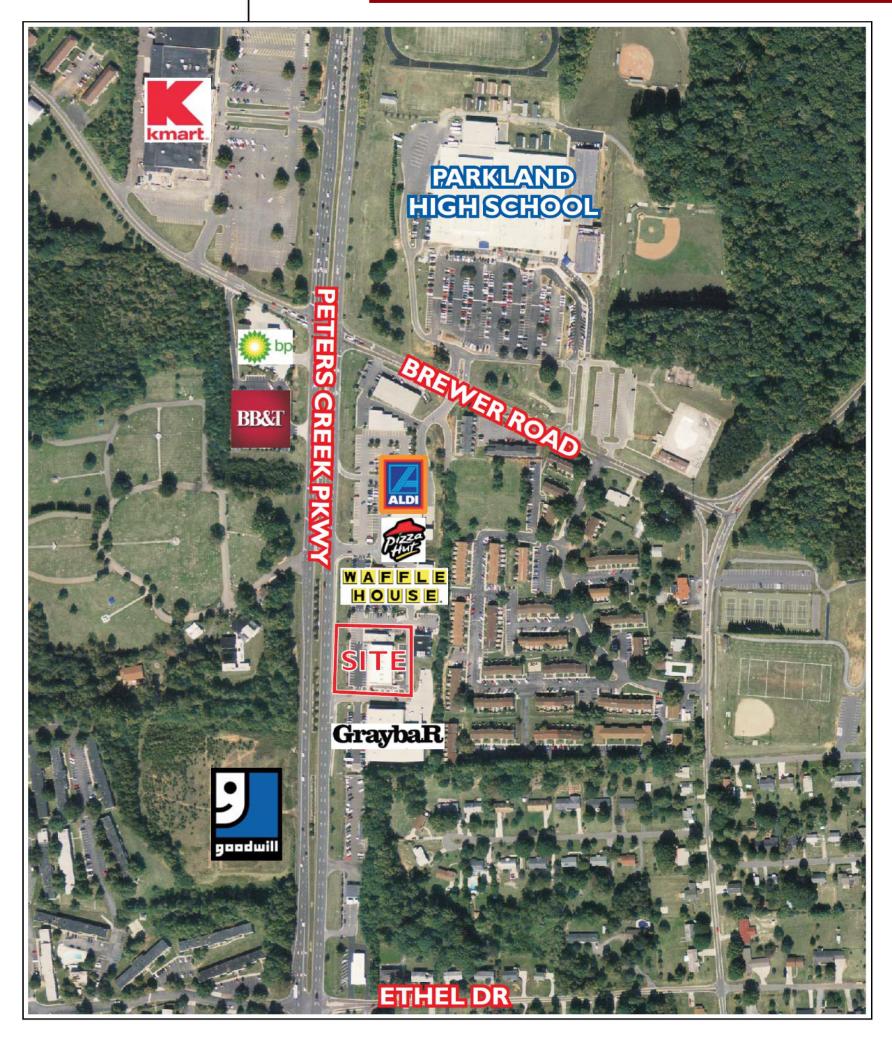
Every effort has been made to ensure the accuracy of the information presented but no liability is assumed for errors or omissions. This offering is subject to prior sale, lease, change or withdrawal without prior notice and approval of owner.