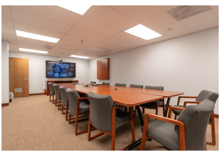
KW COMMERCIAL 2401 W. Main Rapid City, SD 57702