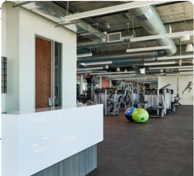
Fitness Center / Yoga Studio