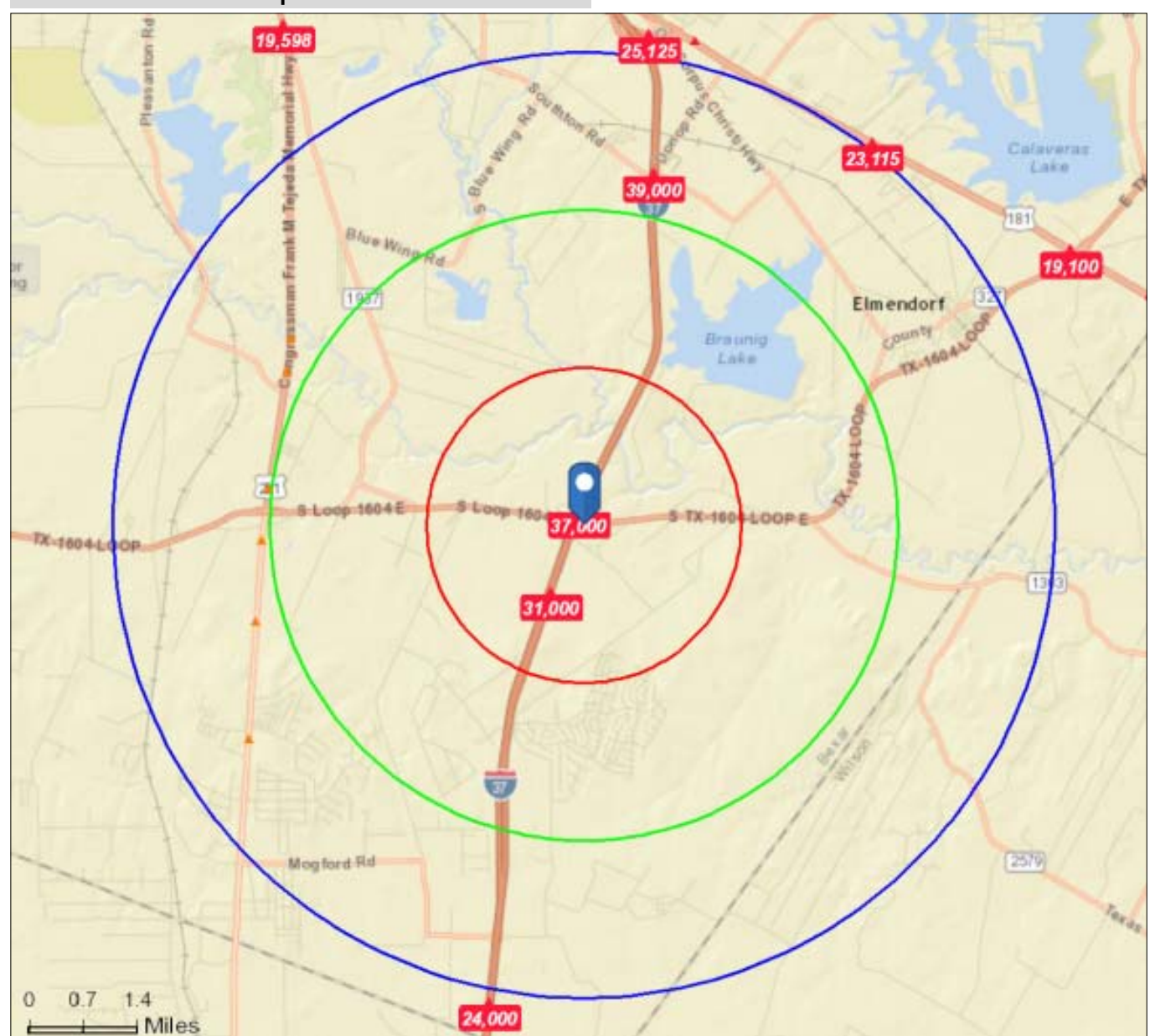
Traffic Count Map

Loop 1604 & I.H. 37 +/- 6 Acres For Sale Elmendorf, Texas