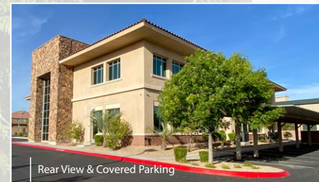
Rear View & Covered Parking