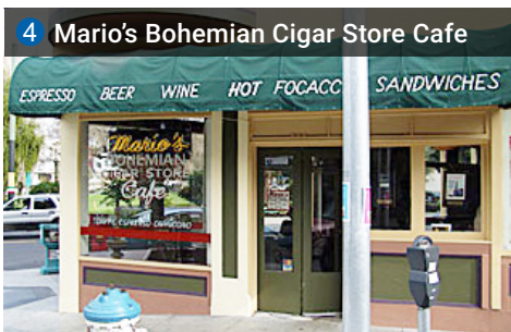
4 Mario's Bohemian Cigar Store Cafe