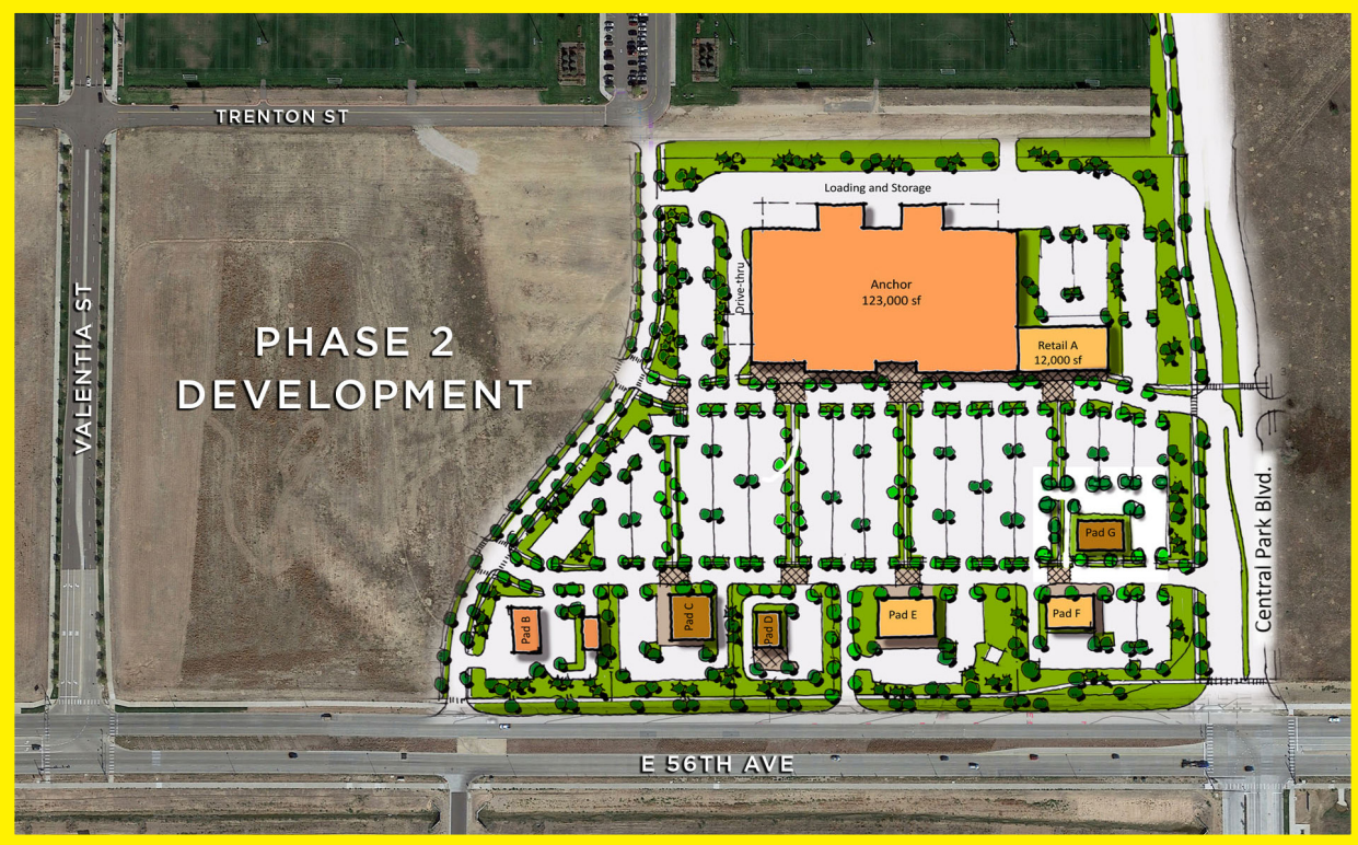
Conceptual Site Plan

STAPLETON 1,600 New Homes 400 Multi-Family Units