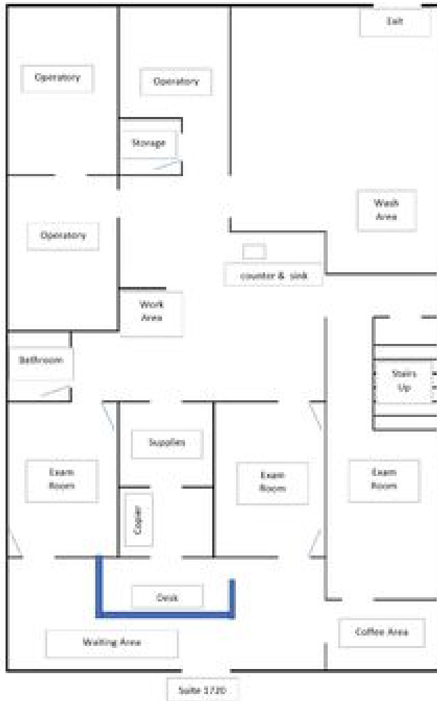
1720 Floor Plan