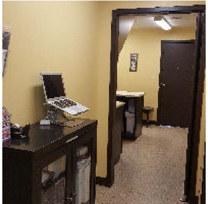
Exam Room 1