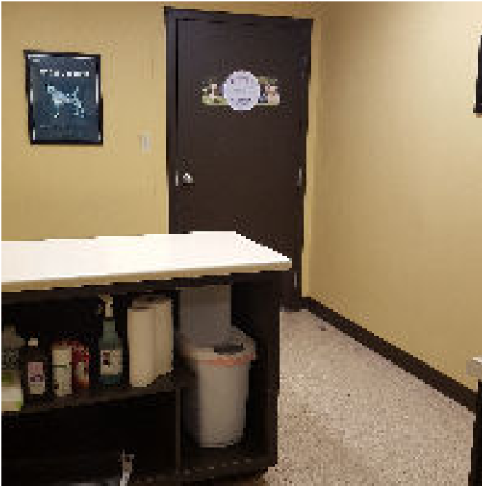
Exam Room 2