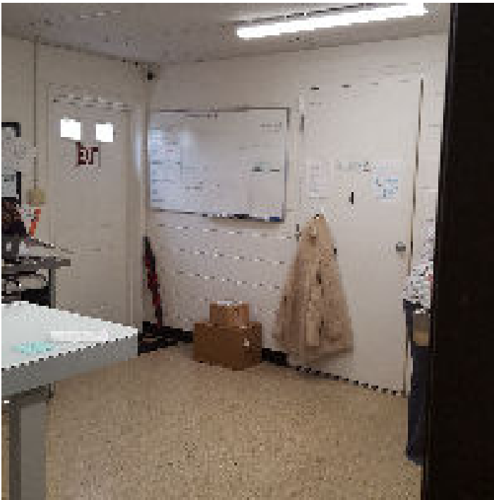
Rear Exit Area