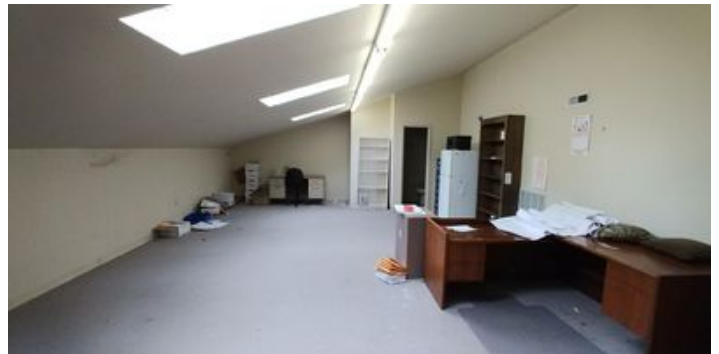
Upstairs Medical Space