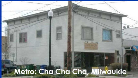
Metro: Cha Cha Cha, Milwaukie

DOES YOUR FIRST IMPRESSION NEED A FACE LIFT? (before)