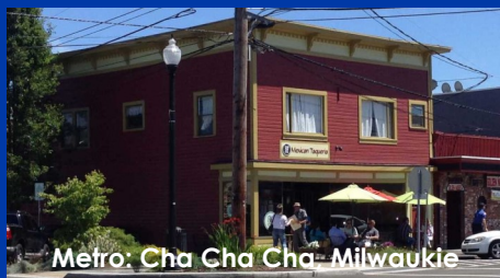
Metro: Cha Cha Cha, Milwaukie