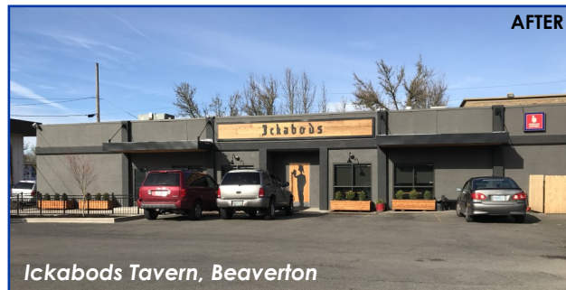
Ickabods Tavern, Beaverton