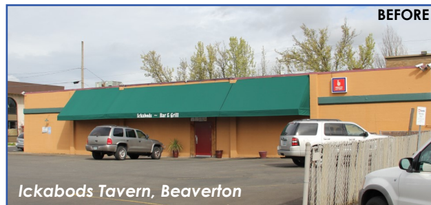
Ickabods Tavern, Beaverton

The city can also provide design services using a city contracted architectural firm. Applicants are encouraged to take advantage of this or work with their own professional designer prior to submitting an application for improvements.