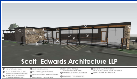
Scott Edwards Architecture LLP