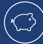
Average Household Income (2018)