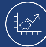
Projected Average Household Income (2023)