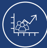
Population Projection (2023)