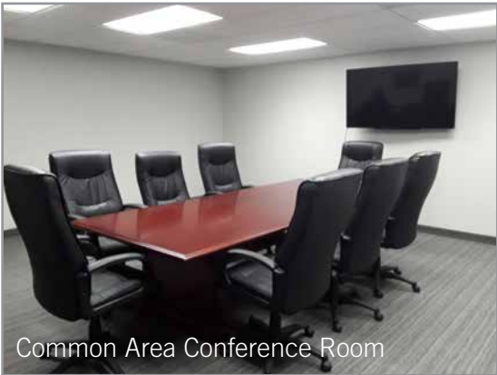
Common Area Conference Room