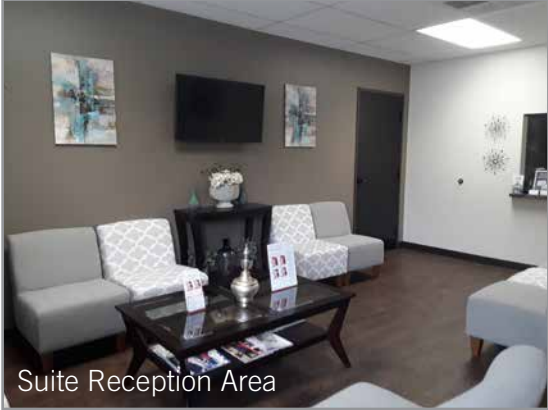
Suite Reception Area