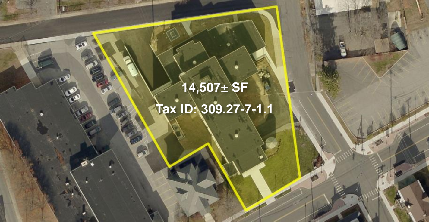
Approximate site lines; subject to survey verification