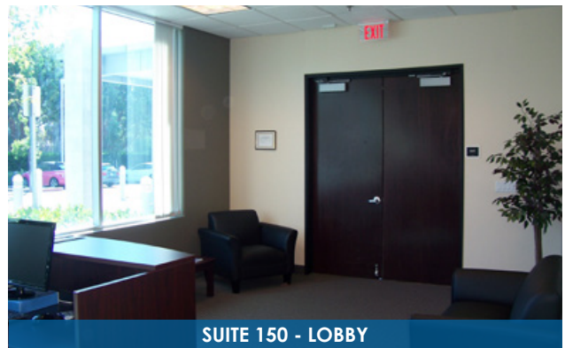
SUITE 150 - LOBBY