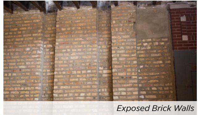
Exposed Brick Walls