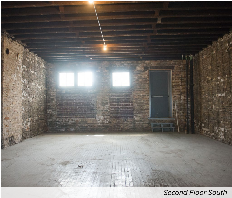
Second Floor South