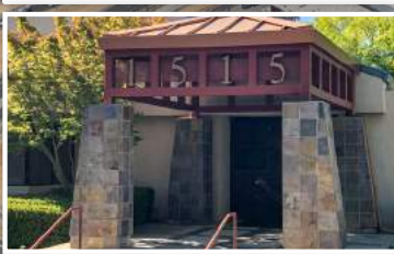
1515 RESPONSE ROAD