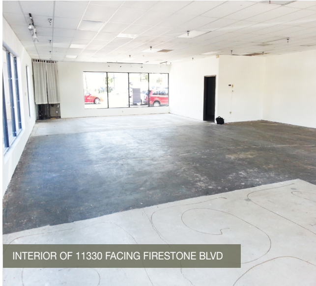
INTERIOR OF 11330 FACING FIRESTONE BLVD

11330-11334 FIRESTONE BLVD, NORWALK, CA 90650