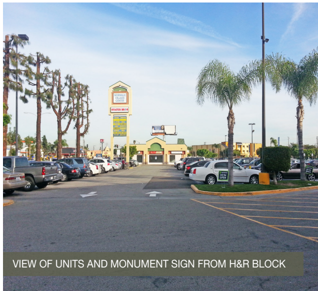
VIEW OF UNITS AND MONUMENT SIGN FROM H&R BLOCK