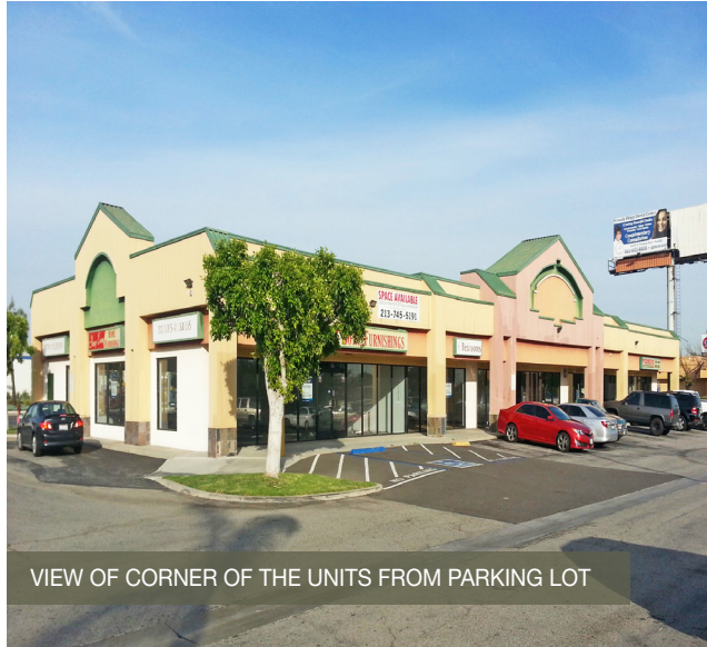
VIEW OF CORNER OF THE UNITS FROM PARKING LOT