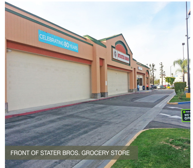
FRONT OF STATER BROS. GROCERY STORE