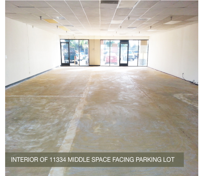
INTERIOR OF 11334 MIDDLE SPACE FACING PARKING LOT