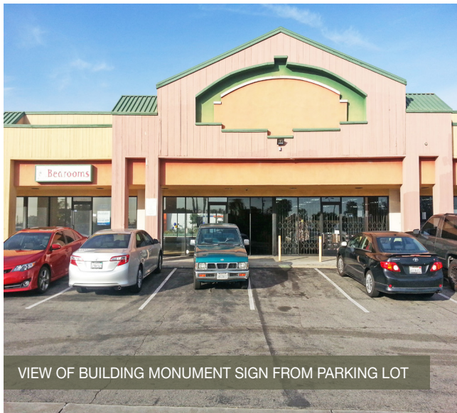
VIEW OF BUILDING MONUMENT SIGN FROM PARKING LOT