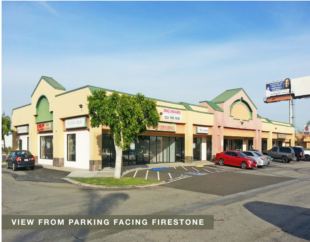
VIEW FROM PARKING FACING FIRESTONE