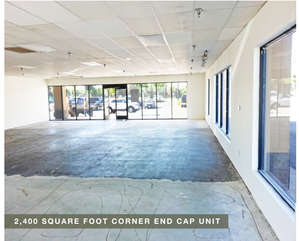
2,400 SQUARE FOOT CORNER END CAP UNIT