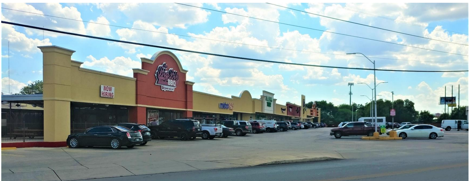
View from subject site looking across Lanark Dr