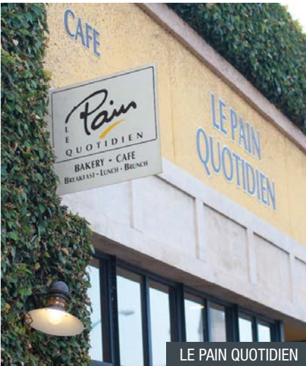
LE PAIN QUOTIDIEN