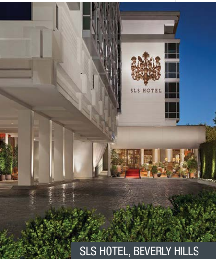
SLS HOTEL, BEVERLY HILLS