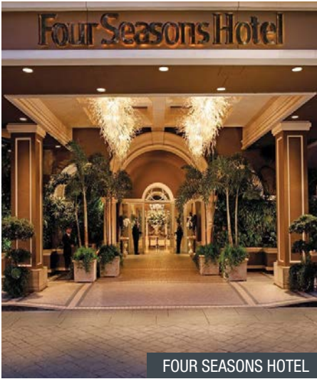
FOUR SEASONS HOTEL