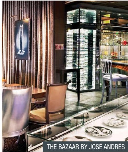
THE BAZAAR BY JOSÉ ANDRÉS